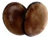
Brown Mink Faux Fur